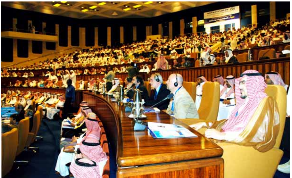
The number of Conference participants far exceeded all expectations, particularly in the case of women.

Ministers of Education from the countries belonging to the Gulf Cooperation Council, and other Arab states, as well as representatives from developing countries in Asia, attended the conference. In addition, several world-renowned experts were invited to share their expertise as speakers at the Conference. Therefore, it represented a unique opportunity to promote the principles of Media Education in the region, and to inaugurate a new line of mutual collaboration and multicultural dialogue.