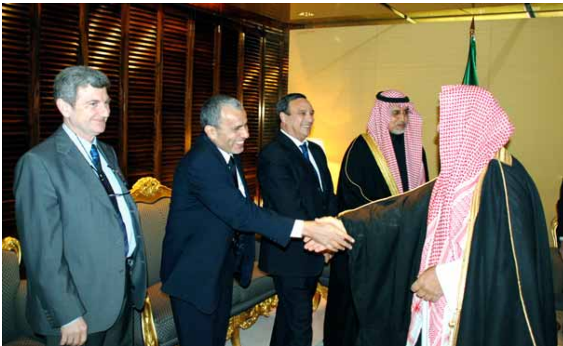
Mentor President and Secretary General welcoming HE Dr Abdallah Al Obeid, Saudi Minister of Education and HH Prince Khalid Al Saoud, Deputy Minister of Education for Girl's Education.